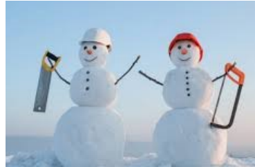
"Be Cautious—We Are Still Working"