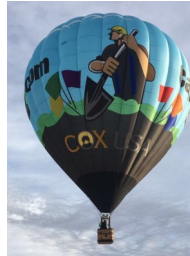
"Call 811 Before Those Spring Projects"